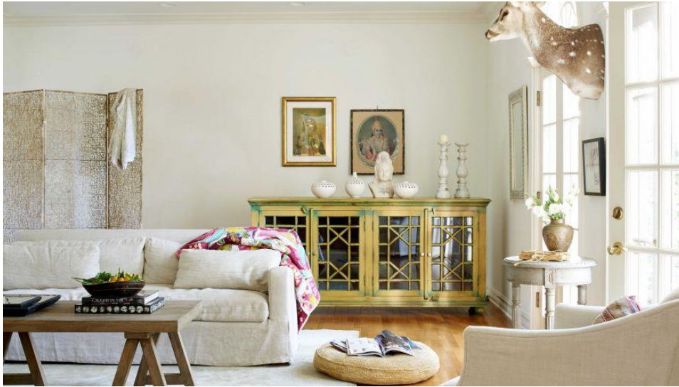
Furniture With a Soul

To give the illusion of having higher ceilings and a larger room, look for furniture that is lower to the ground. Most couches are 18-19 inches from the floor to the cushion top, but you can find them as low as 14-15 inches. – Brian Pickler, President of Nadeau - Furniture with a Soul