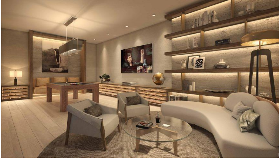
Auberge Beach Residences Fort Lauderdale