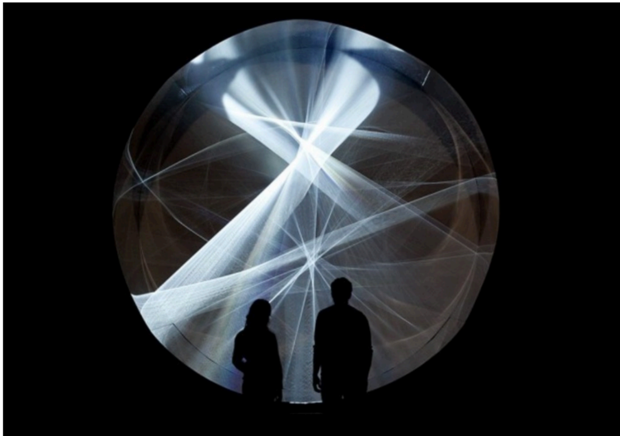
"Julio Le Parc: Form Into Action," exhibition on view at PAMM through March 19, 2017. Julio Le Parc, Continuel-lumière cylindre (Continuous Light Cylinder), 1982/2013 Painted wood, stainless steel, motor, metal disk, and light. Dimensions variable.

contemporary art latin american art sculpture