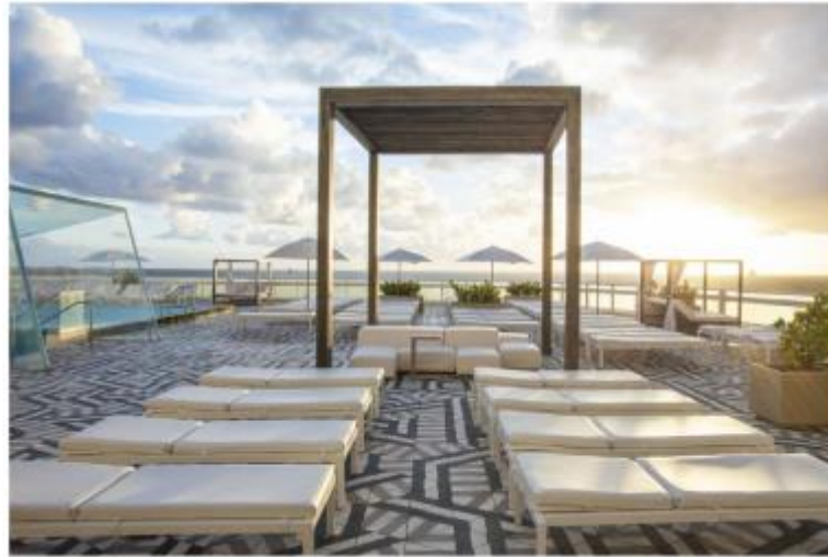
WET on the roof