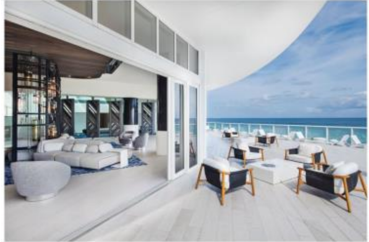
Living room's outdoor patio