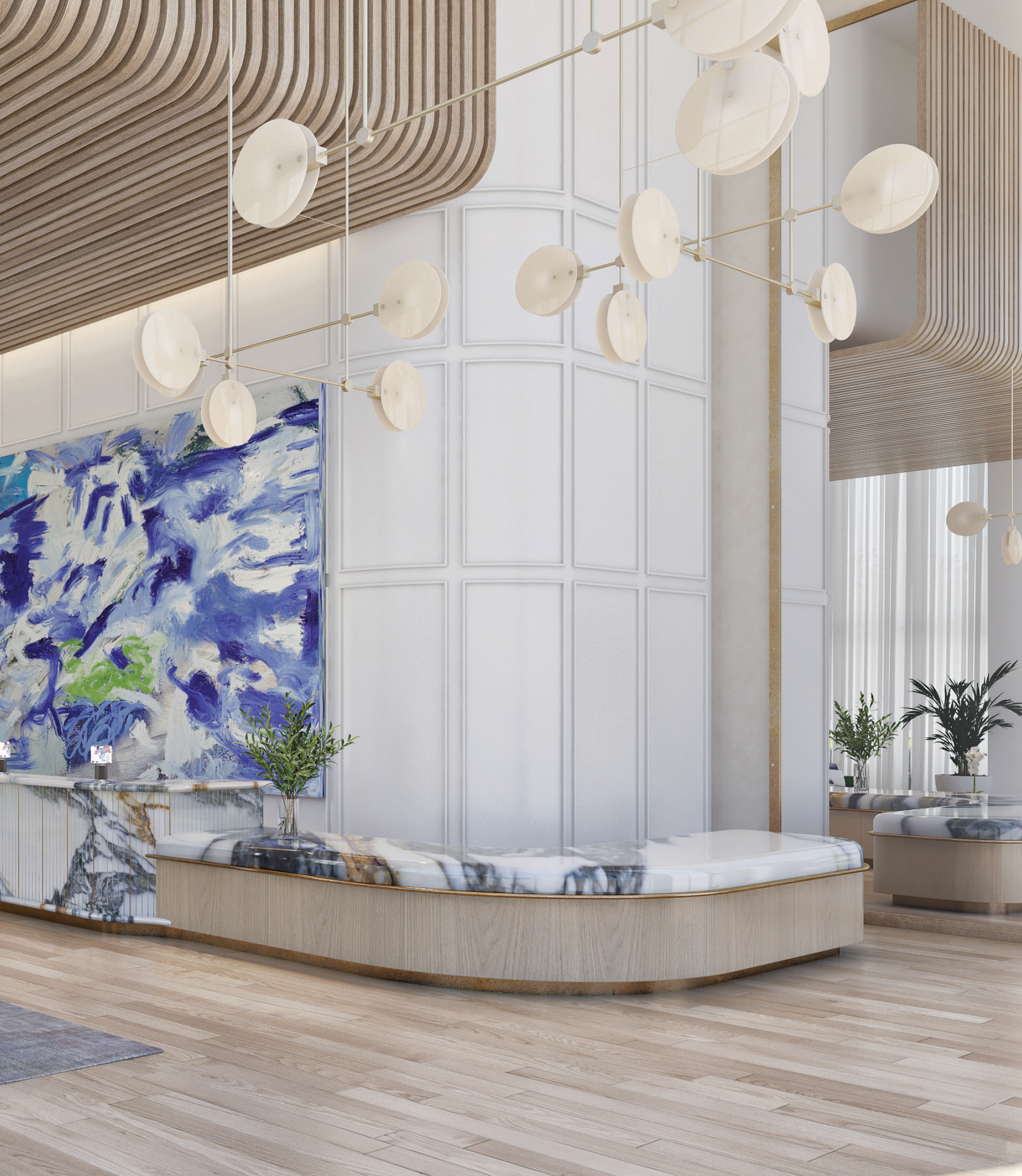
Reception with personalized concierge