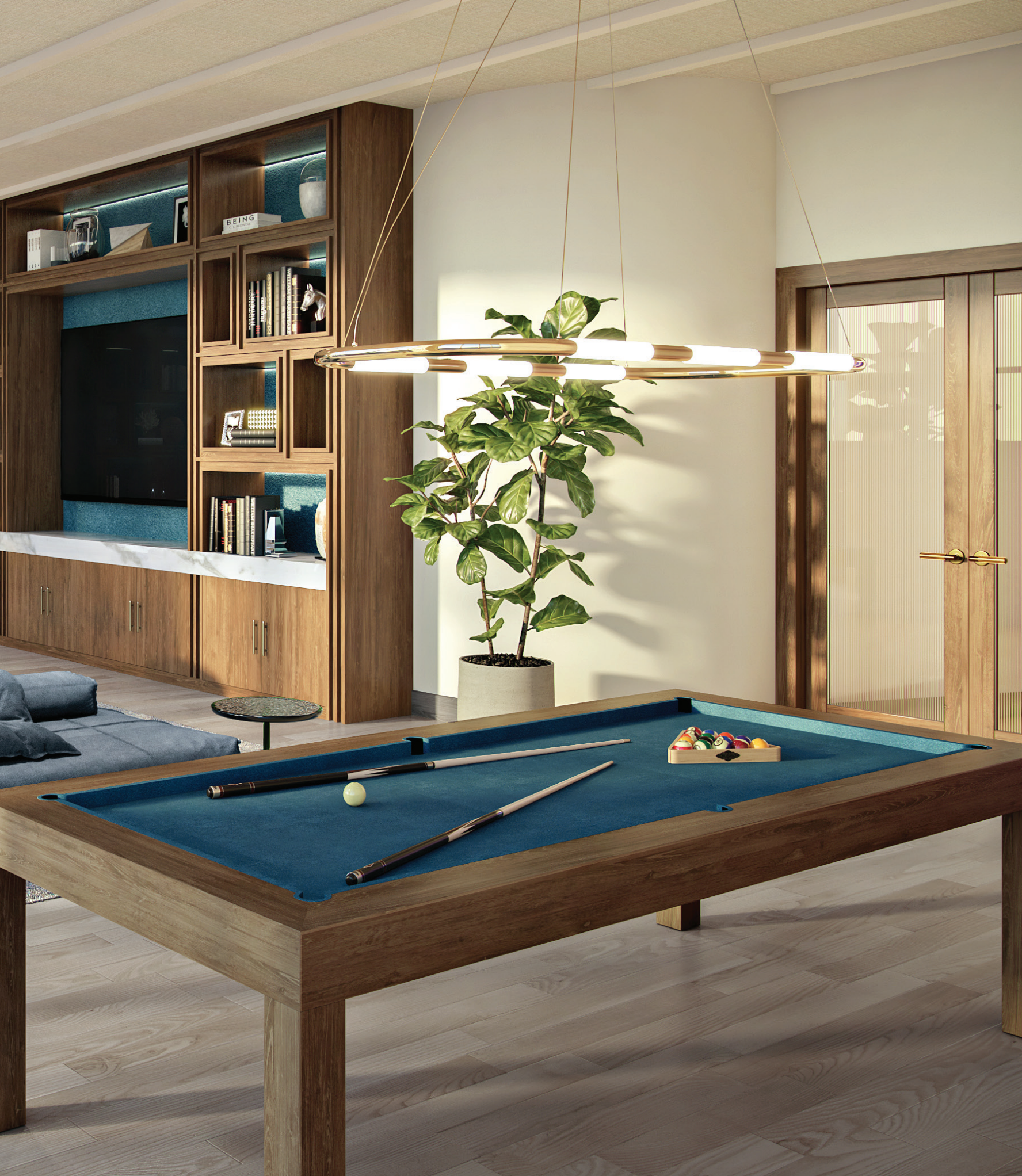
Immersive media lounge with gaming tables