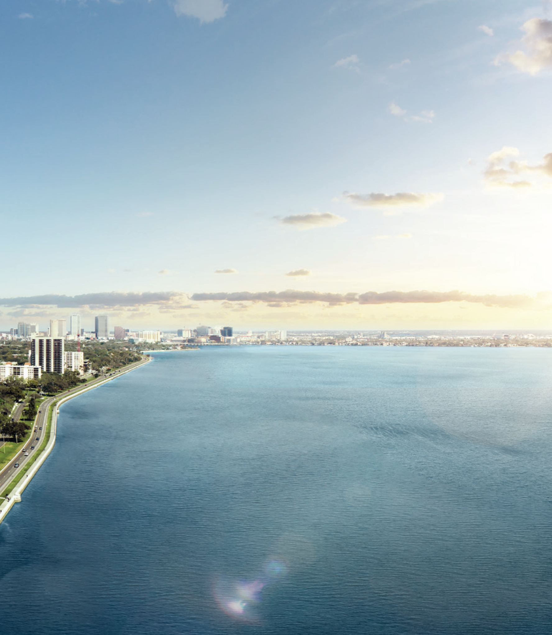
Balcony view overlooking Hillsborough Bay and downtown Tampa