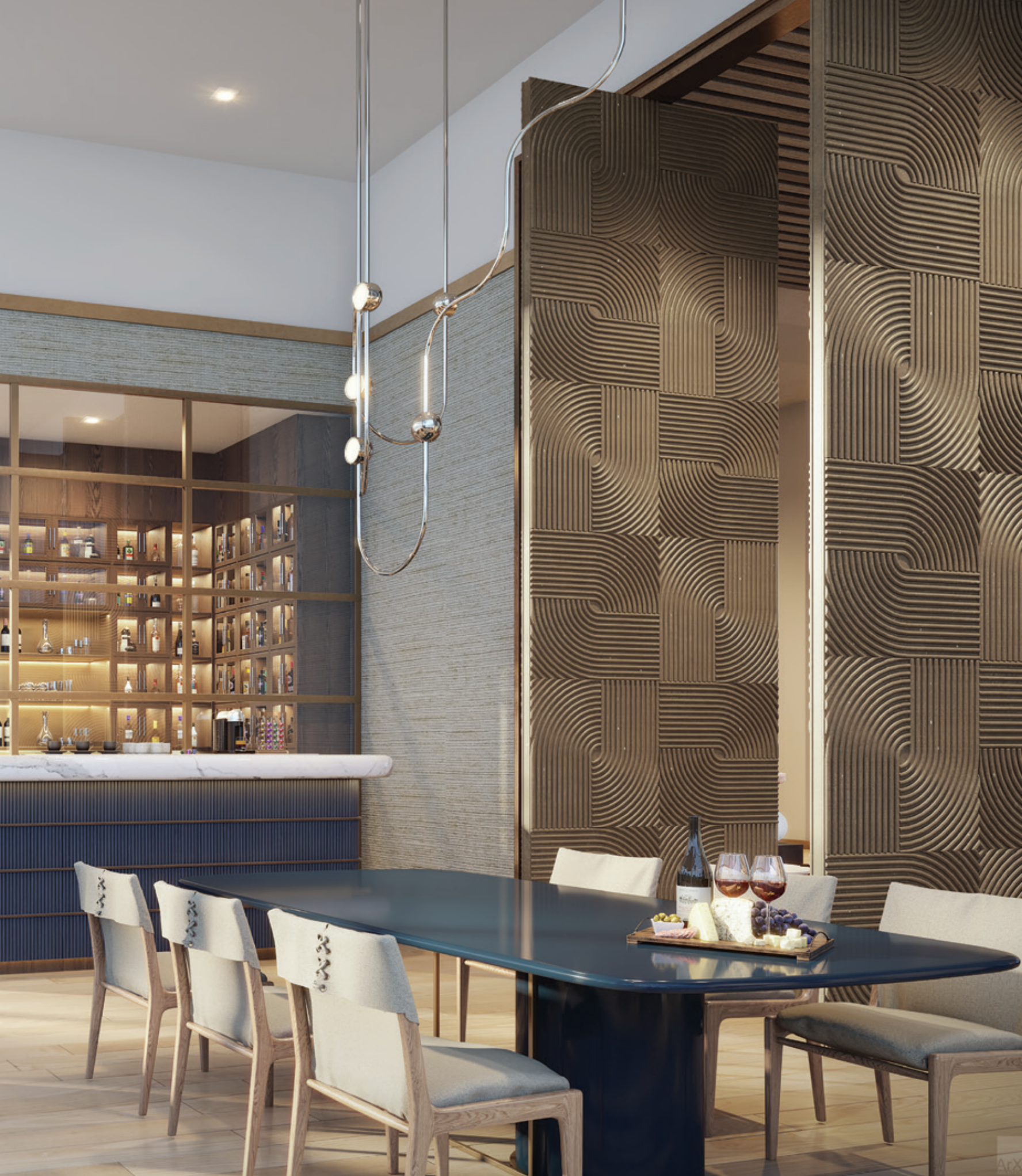
Wine room with temperature-controlled storage