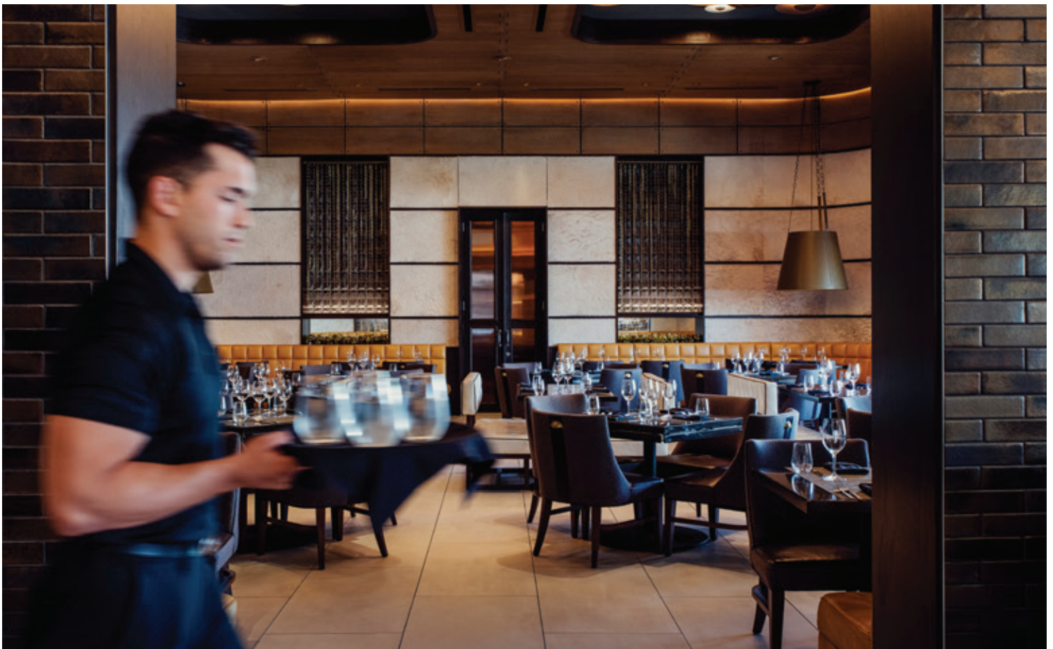
Hyde Park Village shopping and dining