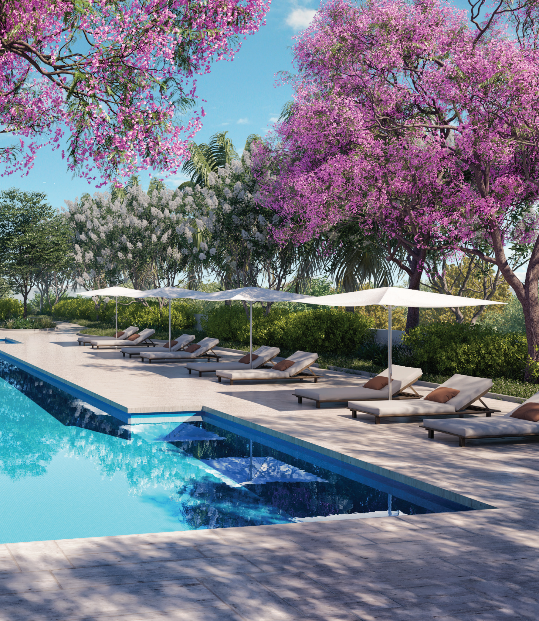
Large amenity deck with swimming pool, spa, and towel service