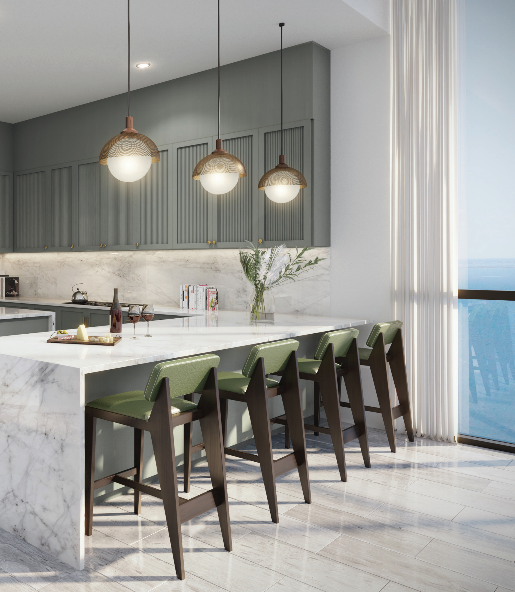
Light-filled kitchens with Sub-Zero and Wolf appliances