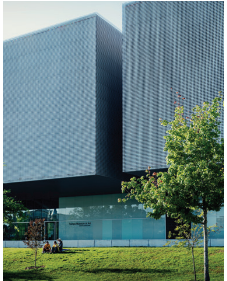
Bayshore Boulevard and Tampa Museum of Art