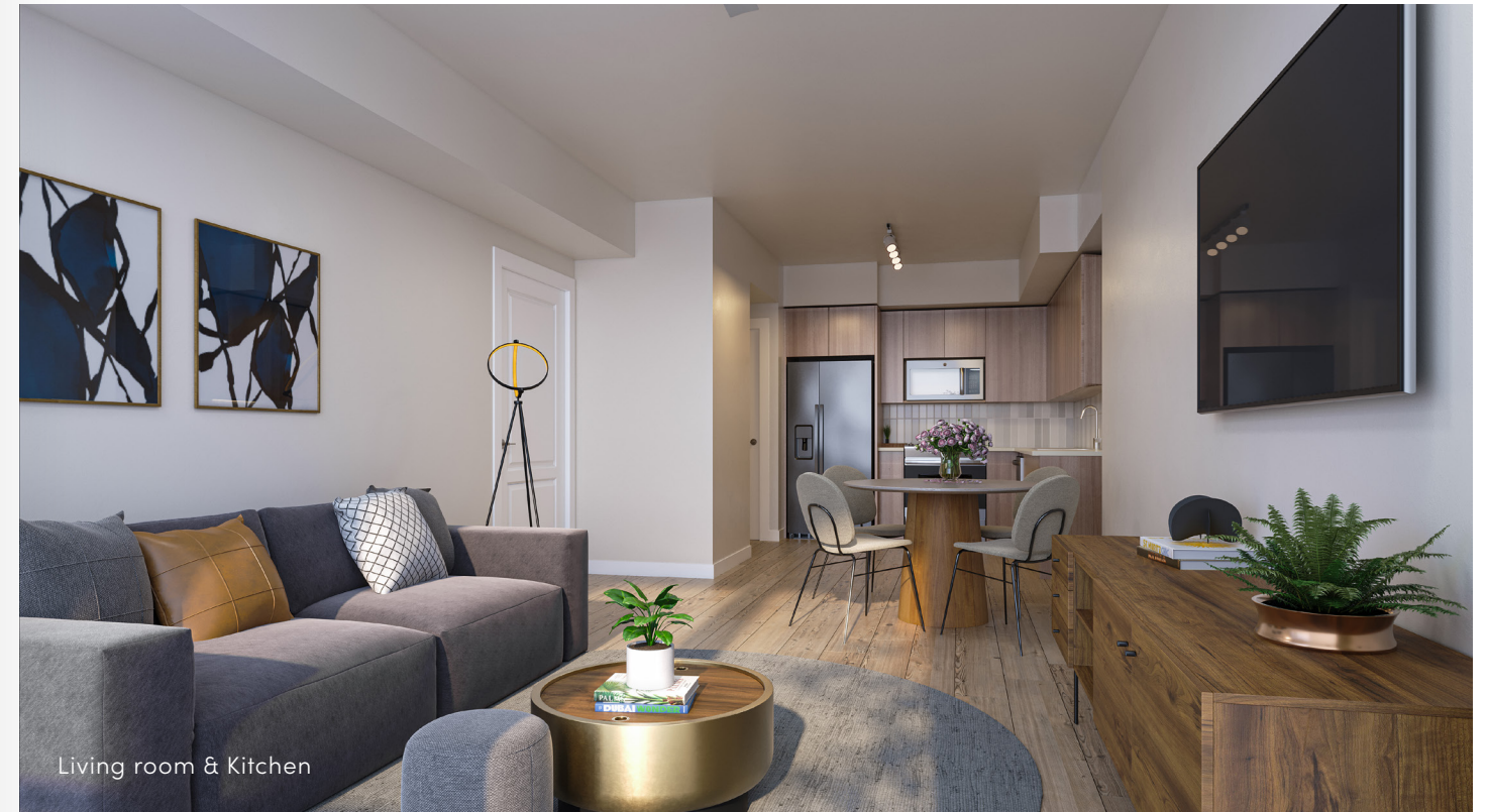
Living room & Kitchen

Everything you could dream and beyond—all at your doorstep.